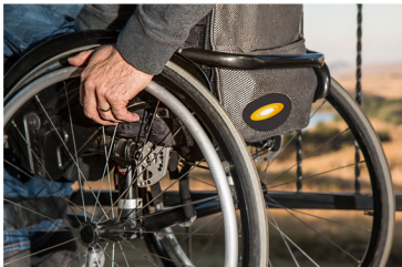
Home Care Equipments