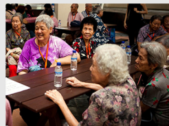
Corporate Social Responsibilities