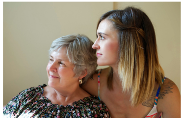
Home Care Services